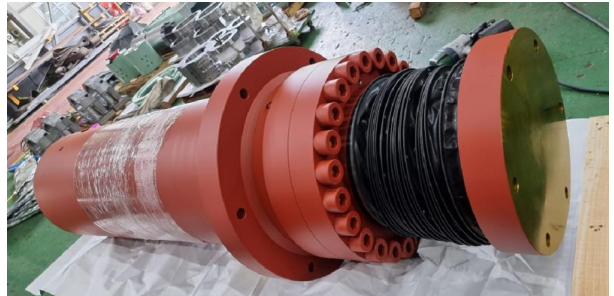
Hydraulic Steel Slag Compression Cylinder