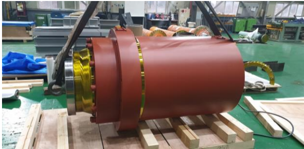
Hydraulic Forging Press Cylinder

Since then, clients like POSCO and Hyundai Steel have been choosing our cylinders over German, U.S., and Italian suppliers for our price and lead time advantages.