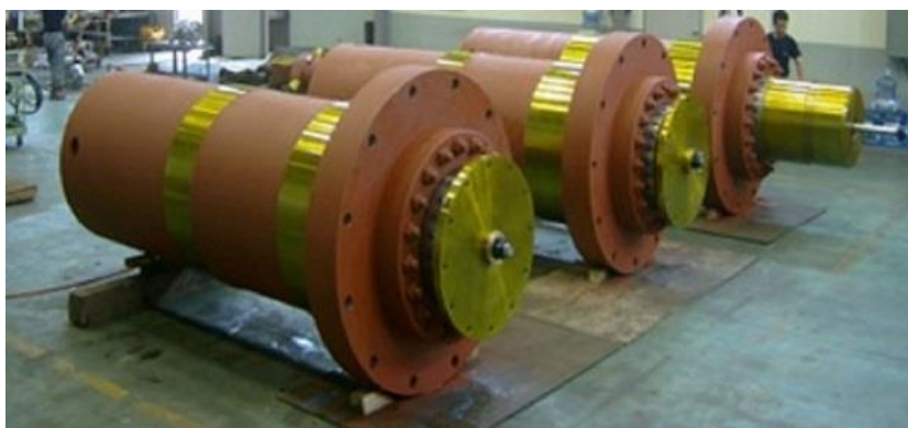
Main Cylinders for Hydraulic Forging Press

Our heavy-duty cylinders are used in hydraulic press machines of up to 10,000-ton capacities. Our typical cylinder fluids include VG46 mineral-based hydraulic oil (high performance oil), water glycol, and bio-based hydraulic oils, and we can accommodate to our clients' specific requests.