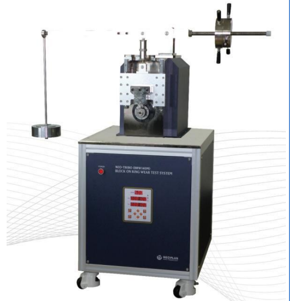
Exclusive test equipment for Block-on-Ring. Performs stable friction wear test.