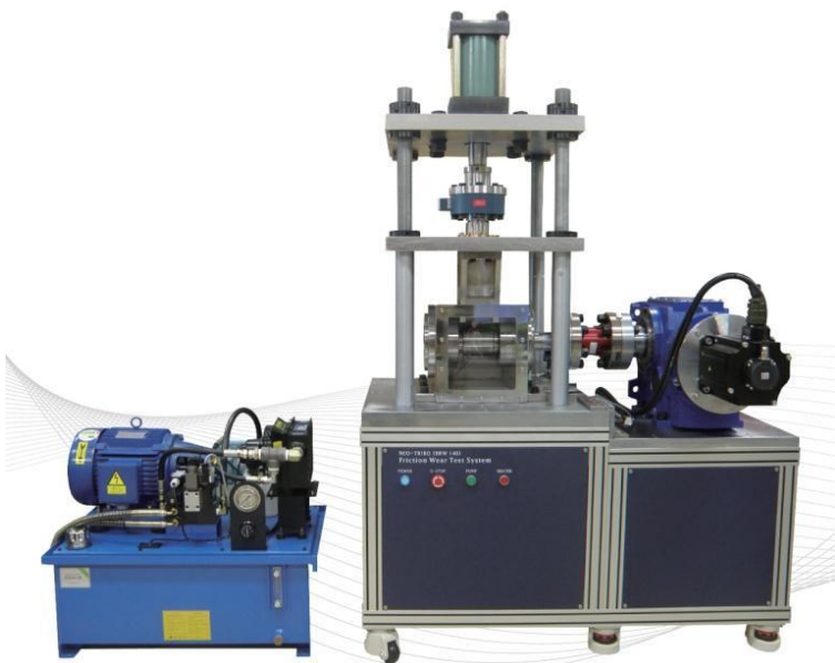
Wear test equipment for heavy loading bearing material using hydraulic systems. It can accommodate heavy loads with low speed testing.

The main control and settings screen are set to control test conditions and continuously observe test results.