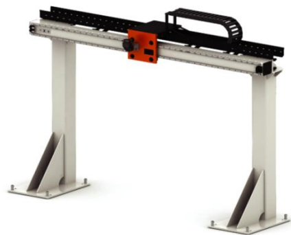
Payload range [kg]